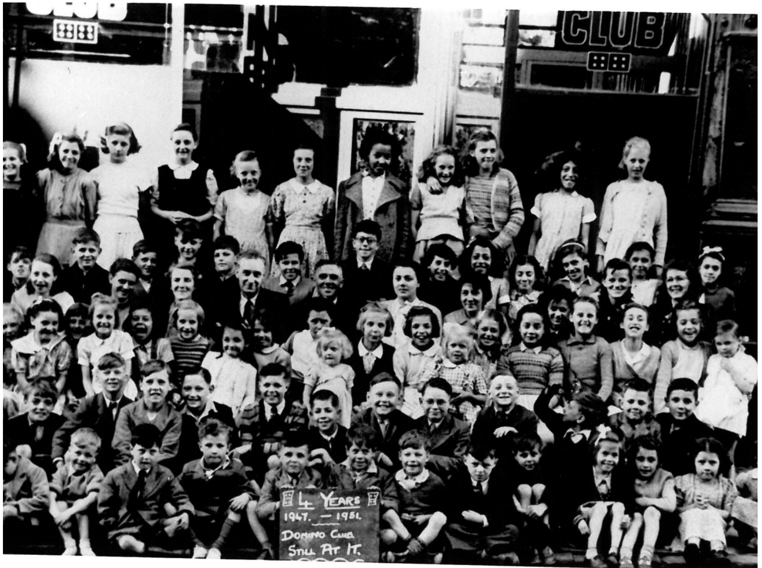
Domino Club. Are you in this picture?