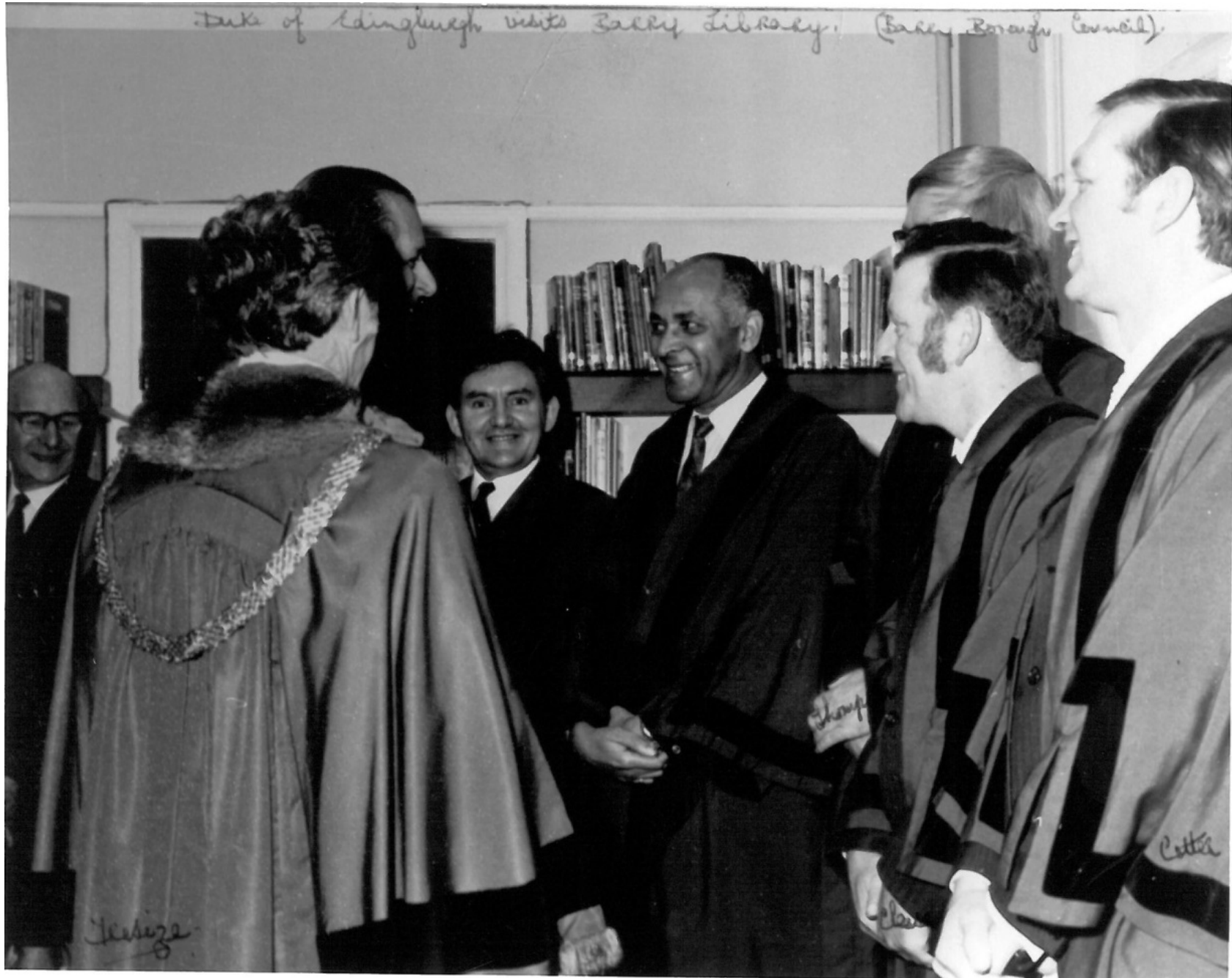
Duke of Edinburgh visits Bally Library. (Bally Borough Council).